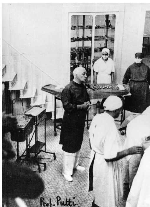
Figure 1. Professor Vittorio Putti in operating room.

By digitalizing the content of the Rizzoli Orthopaedic Institute Library, a census of Vittorio Putti's scientific work could be carried out.