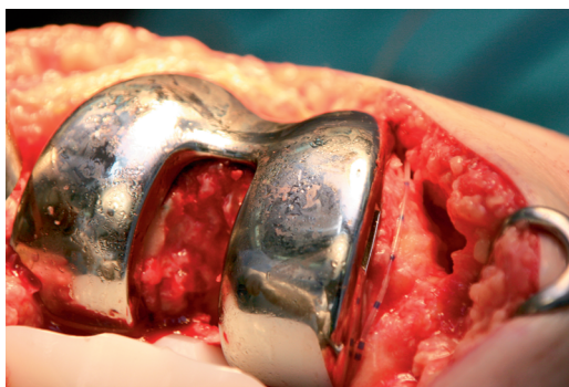
Figure 1. Pain catheter placement in total knee replacement. The catheter is led along the medial femoral condyle, usually on raw bone, medial to the metal femoral component. Using artery forceps, it is then passed posterior to the medial femoral condyle so that the tip lies in front of the posterior capsule.

ensure that the catheter was not caught in the joint mechanism and that it lay in a position such that the RKA mixture could be delivered to all parts of the joint, tissue planes, and under the wound by injecting as the catheter was withdrawn.