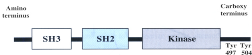
Figure 2. Schematic display of the Gtk structure, indicating the positions of regulatory tyrosines located in the C-terminus.