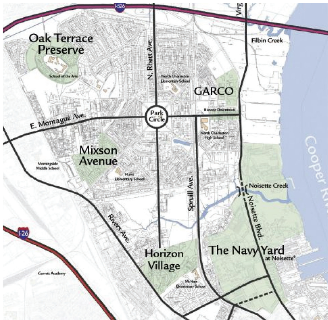
Figure 3. Map of North Charleston showing the location of the Textile plant (GARCO) and the US Navy Yard. The distance from GARCO to the Navy Yard is a few hundred meters. The width of the map is approximately 3.5 km.

chlorinated compounds. The Carbide and Carbon Chemicals Company moved to South Charleston from Clendenin in 1925 and began operations in buildings acquired from the Rollins Chemical Company. Currently it is a division of Union Carbide Corporation, the company was a producer of more than 400 chemicals, plastics and fibers from derivatives of natural gas and petroleum.