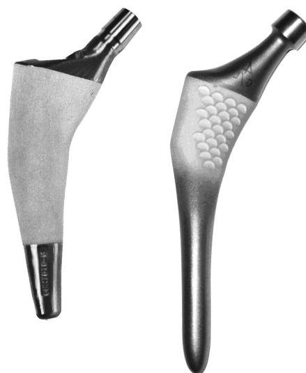
Figure 2. The implants. The Unique stem (left) and the ABG-I (right).

the study to maintain independence of data. Results from 87 patients were available for analysis; 78 of these patients completed the 5-year follow-up—35 patients in the ABG-I group and 43 patients in the Unique group.