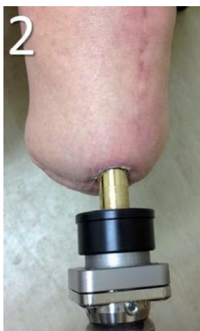
Figure 3. Skin-implant interface for case 2.

degrees. The implants were stable and well aligned (Figure 4C). All patients had complete healing with no discharge at the 3-month follow-up, and none of the cases presented with granulation tissue (Figure 3). Only case 3 had 1 episode of superficial infection and a broken bushing (external abutment).