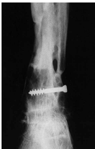
C. 1-year postoperative radiographs show solid bony union.