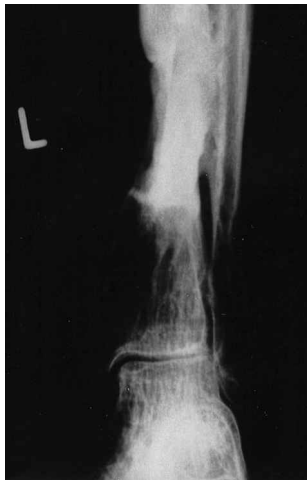
A. Severe ankle arthrosis.