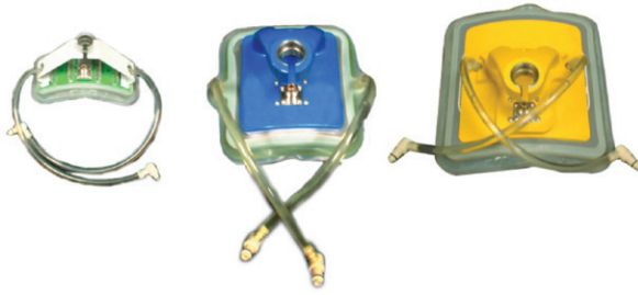
Figure 1. CCMA applicators: from left to right the \alpha , \beta and \gamma applicators.