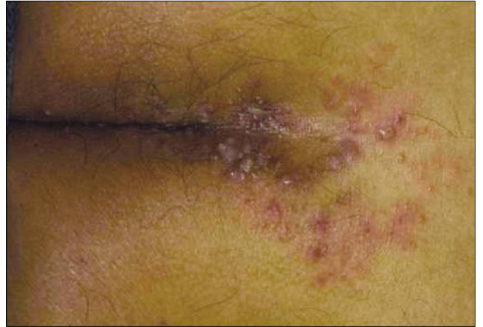
Figure 2. Small pruritic herpetiform bullae on the trunk.