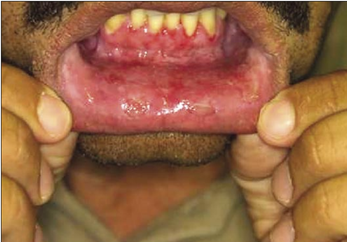
Figure 1. Desquamative gingivitis and superficial erosions on the oral mucosa.

What is the diagnosis? What treatment options exist?