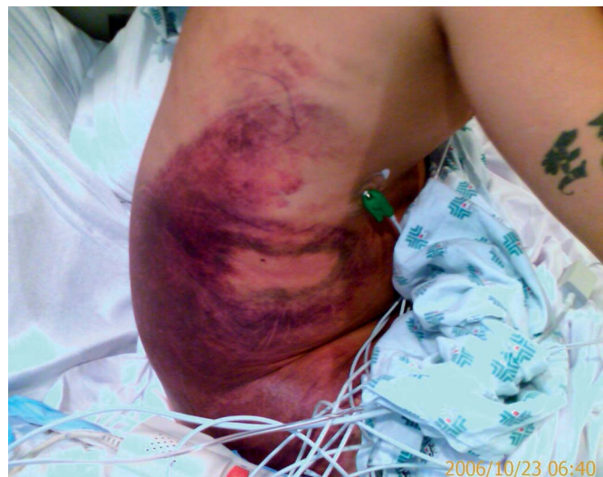
Fig. 1. (a) Right flank 2 days after envenomation by Western Diamondback; (b) Right flank 4 days after envenomation.