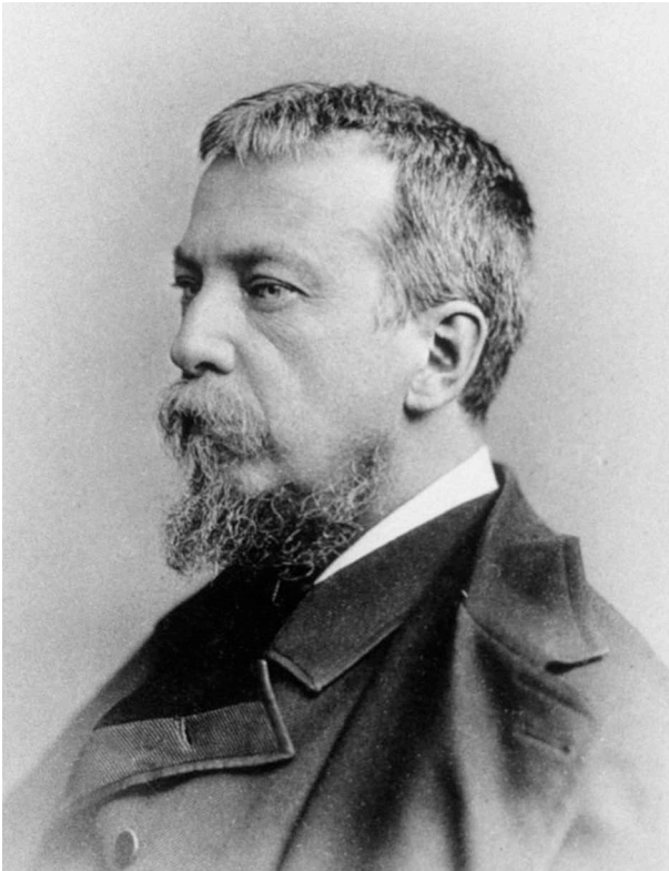
Figure 3. Portrait of Silas Weir Mitchell, the man behind the famous rest cure. (Wikimedia Public Domain).

in those cases where gastric atony was assumed to be a part of the clinical picture. In these cases, immobility was thought to make matters worse and increase the gastro-intestinal atony and associated constipation, and a 'partial rest cure', with massage, 'passive movements' and faradic electricity was recommended instead [32,36]. The element of overfeeding in Mitchell's cure was another topic for debate when it came to the gastric form of neurasthenia. As pointed out by McClure: 'One has to remember that in all these cases there is present a stomach which has lost its tone in greater or lesser degree, which is unusually capacious, and which is very slow to empty. Rest in bed and over-feeding will not help this local condition' [34, p. 698].