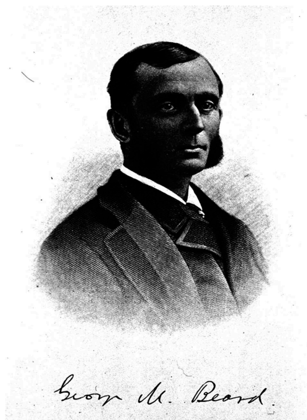
Figure 1. Portrait of George Miller Beard, the ‘father’ of neurasthenia.

reported that gastrointestinal complaints constituted a predominant part of the clinical picture in many neurasthenic patients, and some of these physicians felt the need to define a sub-entity of the wide neurasthenia diagnosis.