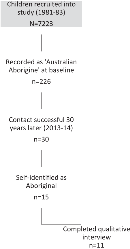
Figure 1. Interviewees were recruited from an existing birth cohort study, the Mater University of Queensland Study of Pregnancy.