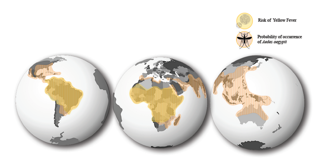
Figure 2. Overlapping distribution of Yellow Fever virus and Aedes aegypti's probability of occurrence. According to the World Health Organization 47 countries in Africa, and Central and South America are considered Yellow Fever endemic countries (Yellow). YF endemic areas are regions where Yellow Fever virus circulation has been reported in either sylvatic or urban cycles, and therefore hold a potential risk of Yellow Fever virus transmission. Transmission of YF in non-endemic areas can be perpetuated upon importation of a YF infected subject to a region endemic to Yellow Fever's main vector, the Aedes aegypti mosquito. Extensive widespread of Aedes mosquitoes (Orange) and the upsurge in international human migration puts half of the world's population at risk upon YF importation.

To date there are at least nine YF vaccine candidates under development, of which one-third have entered Phase I clinical trials. Further information of various vaccine candidates is described in Table 1. Several vaccine platforms are being tested, the use of inactivated virus being the most common approach, as it has been previously proved successful for the development of other arbovirus vaccines.<sup>67,68</sup> XRX-001 is an inactivated vaccine candidate based on a β-propriolactone-inactivated virus generated in cell culture (Vero cells).<sup>40</sup> This vaccine candidate conferred protection to hamsters against lethal challenge through passive immunization and resulted in the generation of neutralizing antibody titers in cynomolgus macaques.<sup>40,69</sup> When XRX-001 progressed to a double-blind, placebo-controlled, doseescalation Phase I safety trial with alum adjuvant, the induction of neutralizing antibodies and seroconversion (endpoint/baseline PRNT<sub>50</sub> > 4) of subjects was reported.<sup>70</sup> Nevertheless, two high doses (4.8 µg of antigen) were required for the development of neutralizing antibodies in 100% of the participants.<sup>70</sup> Despite inactivated vaccines may require multiple doses to match the immune responses mounted by live virus vaccines, often they