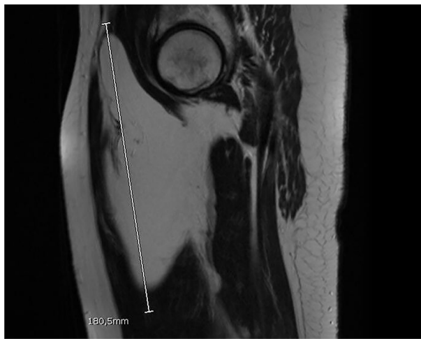
Figure 2. Sagittal section of MRI of lipoma.

pharmacological allergies were reported. Doppler sonography was performed and further investigated with MRI. (Figures 1 and 2).