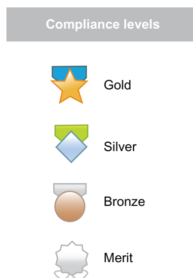
Figure 1 Nanomaterial Registry compliance medals in decreasing order of compliance score range: gold, silver, bronze, and merit.

Abbreviation: DOI, digital object identifier.