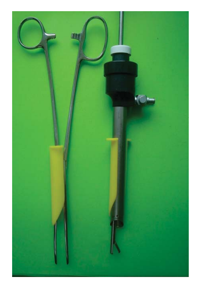
Figure 2. Slit-trocar for gas/gasless laparoscopy.

laparoscopy makes surgery in low gas pressure (1-6 mm Hg) possible with sustained optimal or adequate view (10) and, in case of need, to take temporary measures in a 'gasless' condition. An immediate shift between low, standard and zero gas pressure is possible. With no gas pressure, conventional open surgery instruments such as clamps, scissors and powerful suction devices can be used and with standard gas pressure, the complementary abdominal wall lifting means a 'double' outcome in forming the intraabdominal space. A special slit-trocar facilitates the shifting maneuver between the gas-based and gasless technique (Figure 2). The finding that the centrally positioned camera trocar, except for its normal function as a gastight sleeve for the laparoscope, is also a perfect anchoring device for mechanical lifting, is an enhancement for laparoscopic surgery. 'Yesterdays' gasless laparoscopy must not be confused with liftassisted laparoscopy. The European Association for Endoscopic Surgery states that 'gasless laparoscopy has no clinically relevant advantages compared to low-pressure (5-7 mm Hg) pneumoperitoneum' (11). There may be two exceptions to this: laparoscopy under local anesthesia and lift-assisted laparoscopy under general anesthesia if it is required to use a