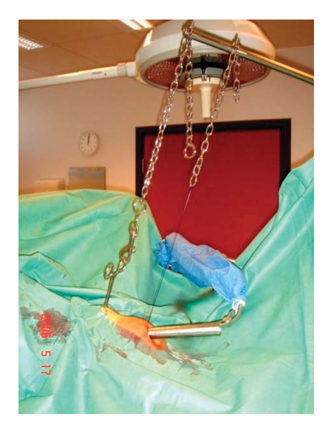
Figure 1. Mechanical lifting.

Using an amnioscope and operate under local anesthesia and mild sedation in an office setting conforms well to the statement of the WHO Task Force on Female Sterilization (6). 'The ideal female sterilization would involve a simple, easily learned, onetime procedure that could be accomplished under local anesthesia and involve a tubal occlusion technique that caused minimum damage. The procedure would be safe, have high efficacy, be readily accessible, and be personally and culturally acceptable. The cost for each procedure would be low and there would be minimal costs for the maintenance of equipment'.