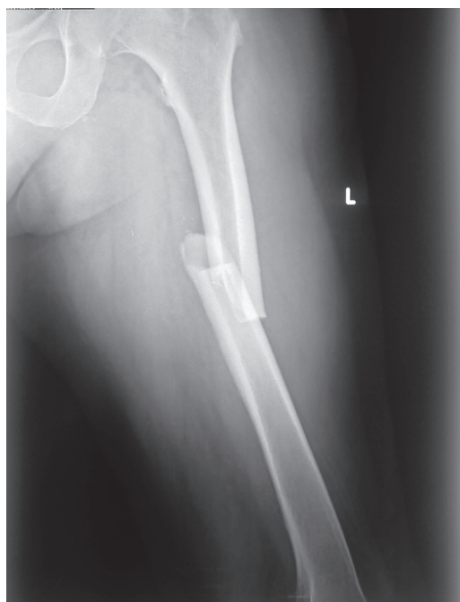
Figure 1. The patient's left femur at the time of the first fracture. A transverse femoral shaft fracture with lateral cortical hypertrophy and medial spiking.

This fracture also healed in 5 months with callus formation (Figure 3). In view of reports linking this pattern of femoral shaft fractures to long-term alendronate therapy (Neviaser et al. 2008) and considering the anti-resorptive mechanism of action of the denosumab, treatment with teriparatide (20 µg subcutaneously once a day) and vitamin D was commenced and denosumab was stopped.