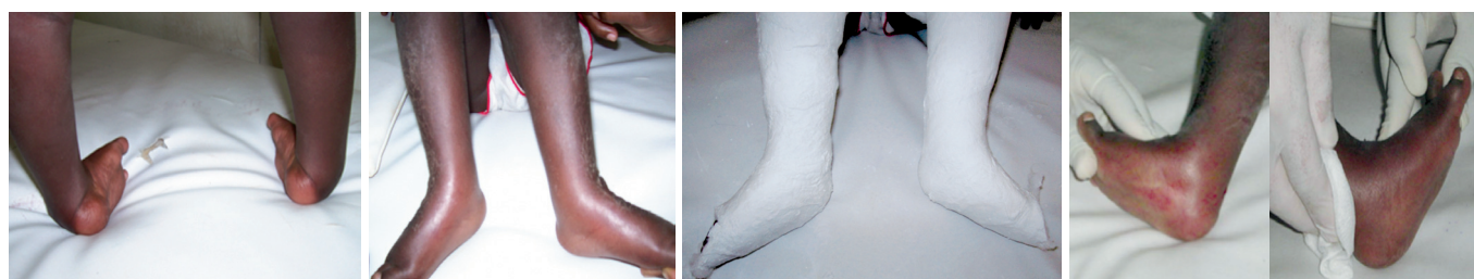
Figure 2. 3-year-old boy before treatment. After 5 casts.

The midfoot was corrected to Pirani 0 in all feet after the casts. The correction was obtained with an average of 8 (6–10) casts, the number of casts increasing with age. In patients up to the age of 4 years, hyperabduction up to 60–70 degrees was achieved in the final cast. In the older children, abduction was only possible up to 30–40 degrees, but this did not appear to reduce the final walking ability. Figure 1 shows how the resid-