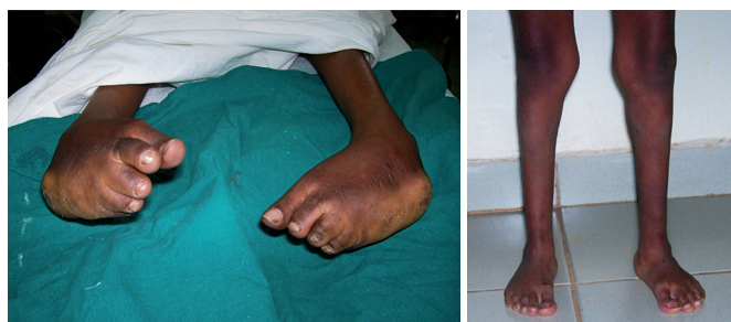
Figure 3. 4-year-old boy before treatment.