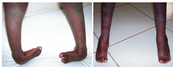
Figure 4. 8-year-old boy before treatment.