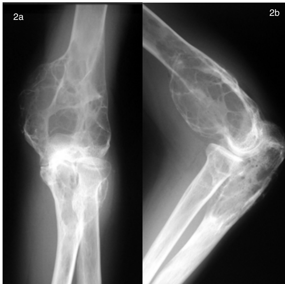
Fig. 2. Plain radiographs of the left elbow. Radiographs showed a ground glass appearance and marginal sclerosis. (a: anterior view; b: lateral view)

An articulated unilateral external fixator (Elbow Fixator, Orthofix Inc., McKinney, USA) was used to preserve the elbow joint function, since internal fixation may lead to tumor dissemination, and post-operative cast fixation can cause joint contracture. At first, we checked the center of the rotation axis of the elbow joint on anteroposterior view and